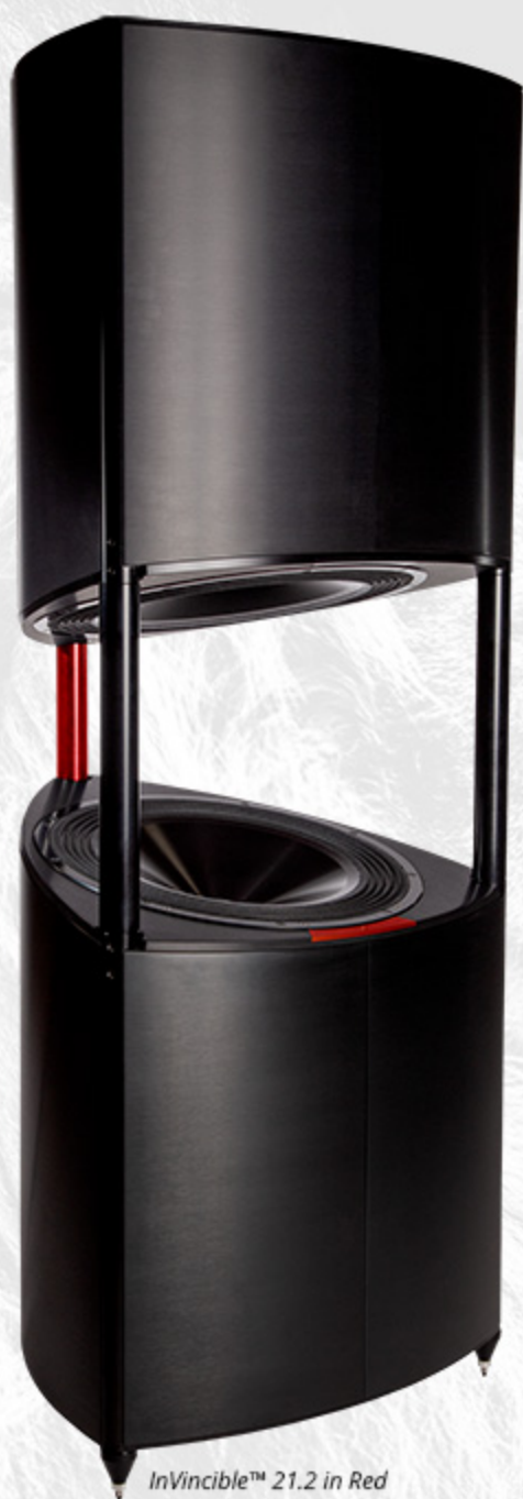
InVincible™ 21.2 in Red